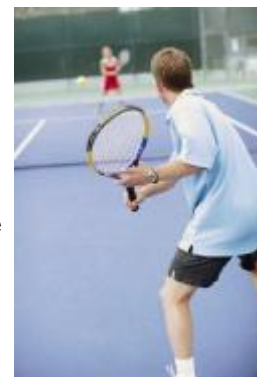
Vail Valley Open Tennis Tournament July 17-19, 2009

Free Body Composition Testing: July 7th, 9-11am. Sign up at the Front Desk.